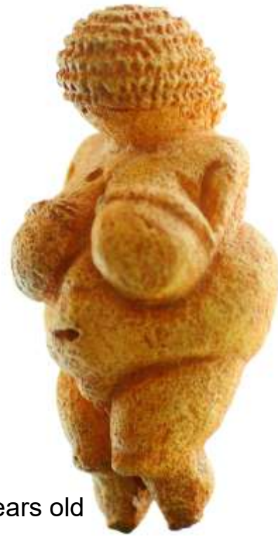
Venus of Willendorf (Austria), about 30000 years old